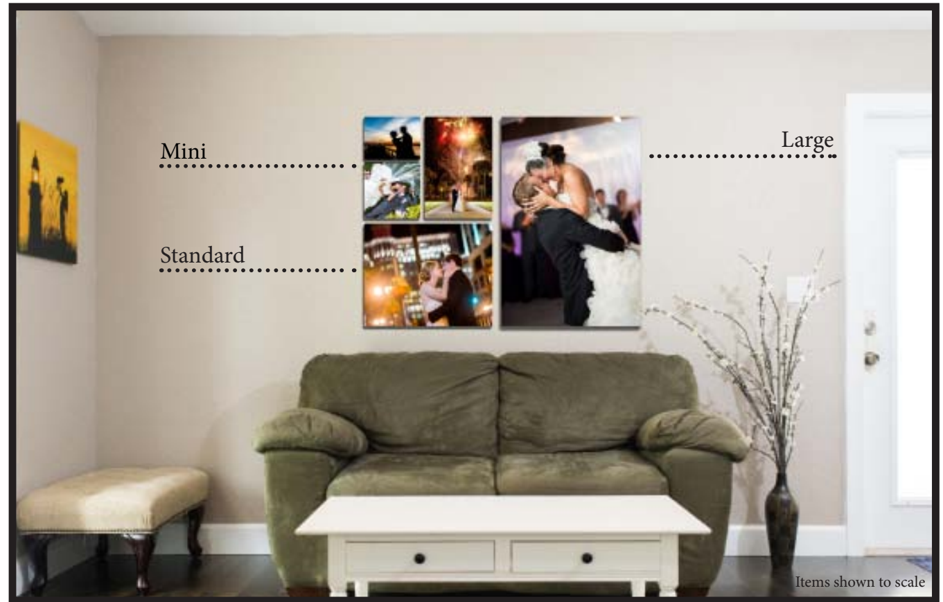
Free floating image - No frame needed! Printed on luster, metallic, or canvas wrapped around a 3/16" core. Ready to hang; backed with pre-drilled foam blocks